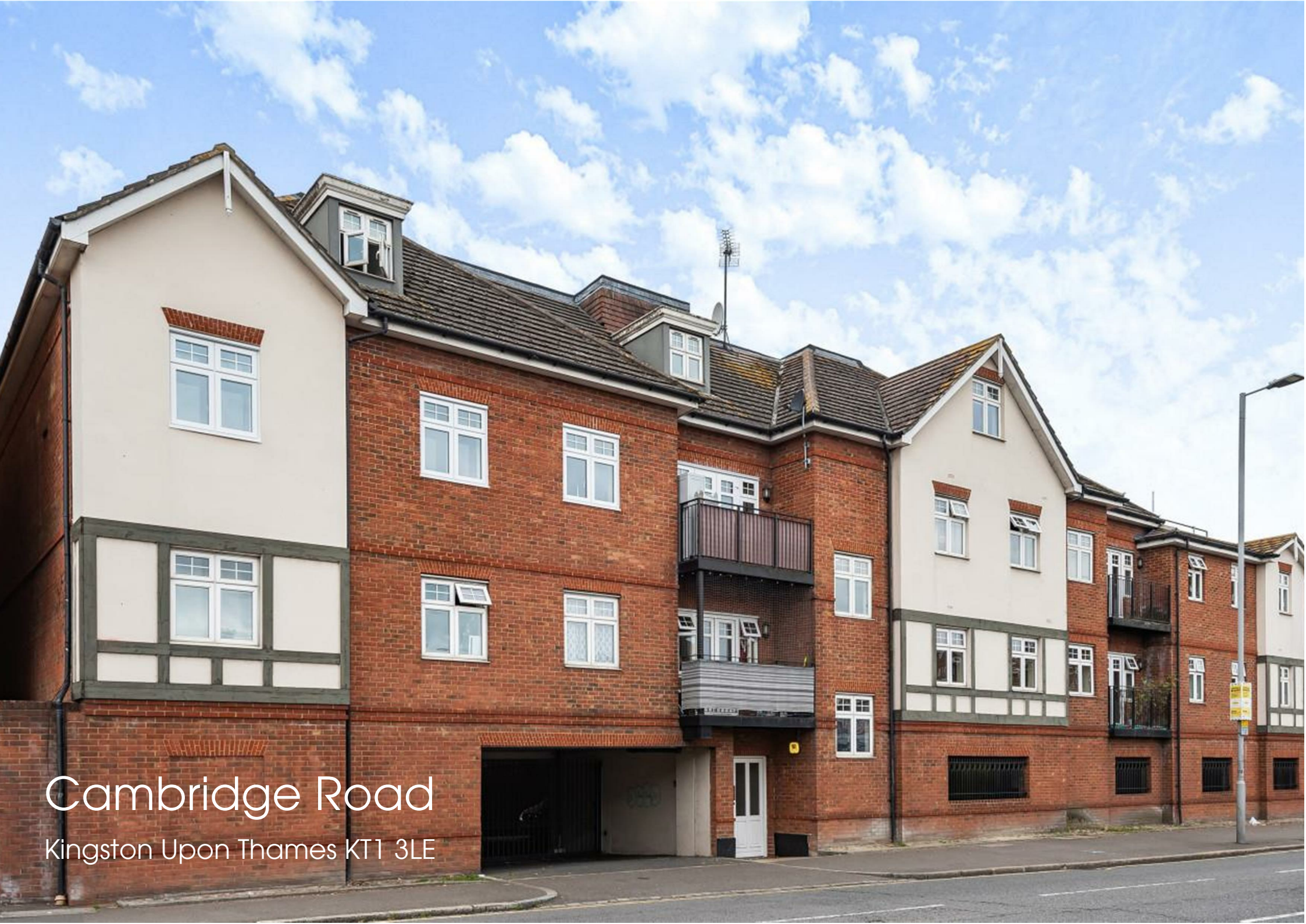
Cambridge Road Kingston Upon Thames KT1 3LE

34 Richmond Road Kingston upon Thames Surrey KT2 5ED www.gibsonlane.co.uk Tel: 020 8546 5444